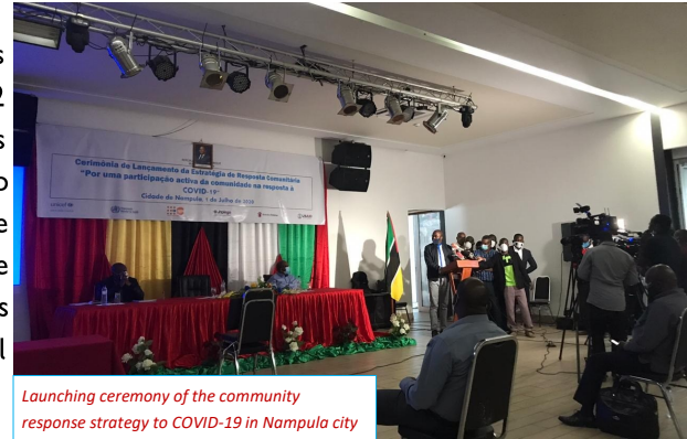
Launching ceremony of the community response strategy to COVID-19 in Nampula city

With the continuation of the State of Emergency, the Government appears to be fighting two battles: saving the national economy from a potential collapse and; preventing the pandemic from spreading to levels that jeopardize its response capacity. Last week the Government has announced that about 1 billion meticaís (USD 14.5 Million) is available to support small and medium-sized businesses in crisis due to the pandemic, to help maintain jobs. The partial opening of airspace for international flights, although with some restrictions, shows the Government's willingness to combine prevention while keeping the economic machine active. Here are some of the Government's achievements: