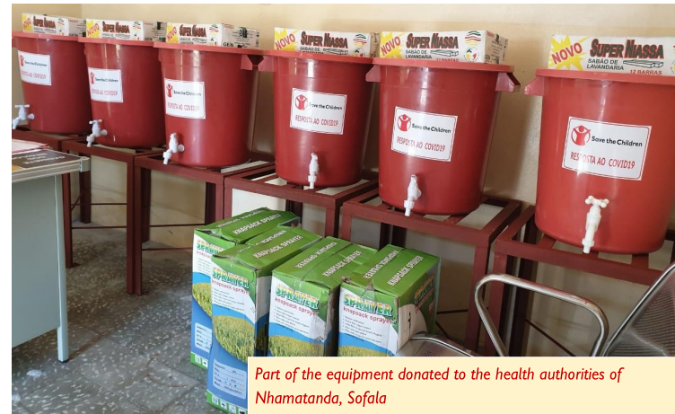
Part of the equipment donated to the health authorities of Nhamatanda, Sofala

sanitation levels by distributing 950 hygiene kits to an equal number of households. These contained a 20 liter bucket with tap, a water jug, three bars of soap, a soap dish, handkerchief, nail clippers, toothpaste, toothbrush and a comb.