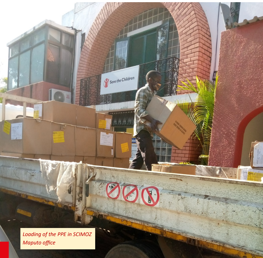
Loading of the PPE in SCIMOZ Maputo office

"The implementation of the State of Emergency measures declared under the COVID-19 pandemic, must not violate the rights of the child. Children must continue to enjoy their rights even during the State of Emergency period".