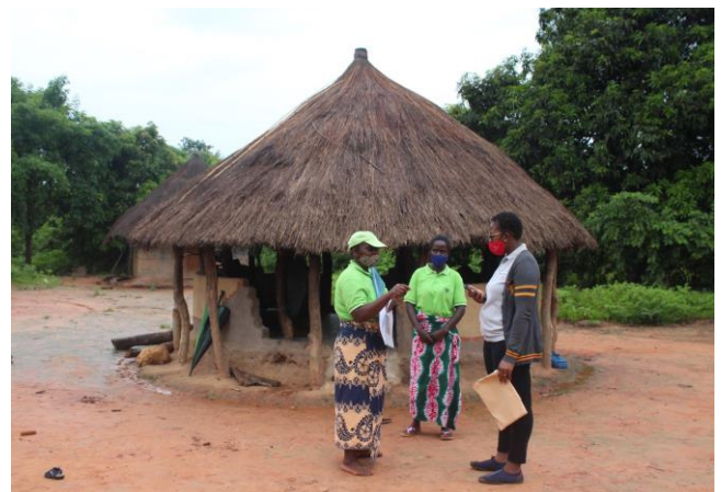
Foto 18: Member of the child protection Committee in Nhandiro Community